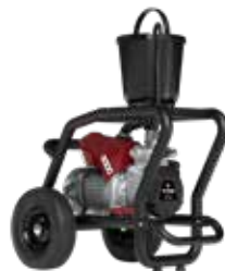
Low Rider with hopper accessory (hopper sold separately)