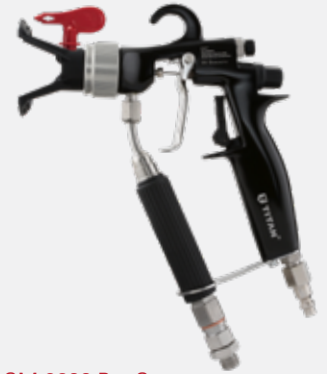
GM 3600 Pro Gun with Reversible Tip Guard 2404548

Design offers ergonomic comfort and a reversible tip system without sacrificing finish quality. Comes with a standard Titan airless gun filter and works with all standard reversible airless and fine finish tips.