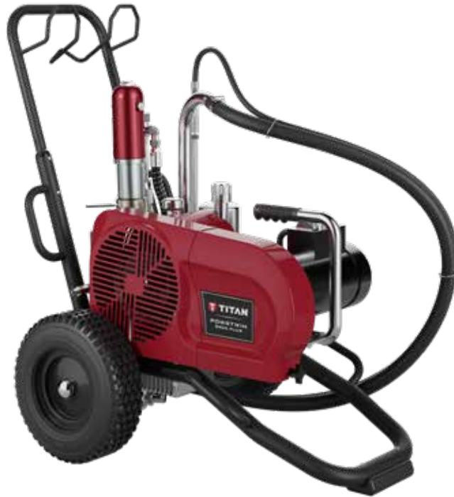
PowrTwin 8900 Plus 4" Stroke