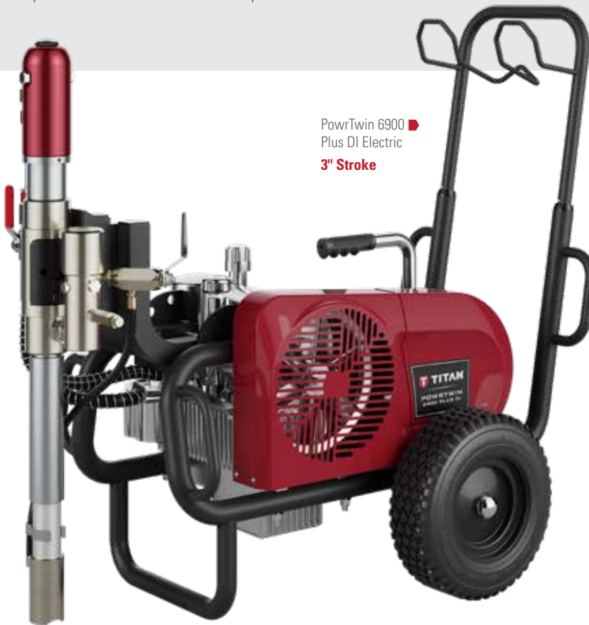
PowrTwin 6900 Plus DI Electric 3" Stroke