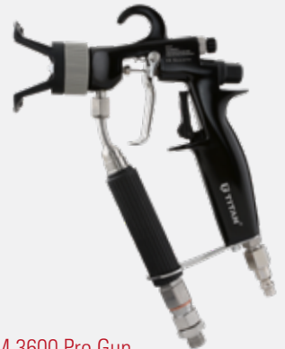
GM 3600 Pro Gun with Flat Tip Guard 2412194

Reversible flat tips are available. AirCap and tips sold separately.