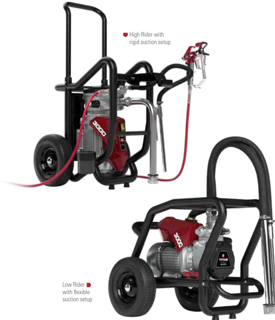
High Rider with rigid suction setup