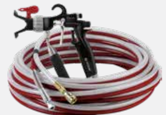
Red/Clear 50-foot Bonded Hose 524333