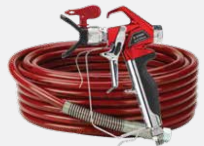
The Elite 3000 comes with RX-Pro Gun, TR1 517 Reversible Tip and 1/4" x 50' Airless Hose.