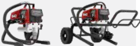
Impact® 640 Skid

The Impact 640 continues the climb to increased performance. This mid-range unit is perfect for residential, property maintenance, rental, and light commercial applications and is equipped with digital technology for improved efficiency.