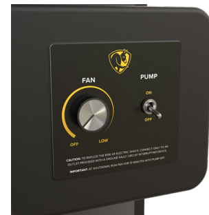
Onboard Variable Speed Control