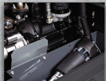
6 | Interior Storage Compartment Holds a 90# breaker or other air tools

BEST-IN-CLASS POWER TRANSFER // FUEL EFFICIENCY // dBA RATING THE INDUSTRY'S HIGHEST-QUALITY MOBILE AIR COMPRESSORS