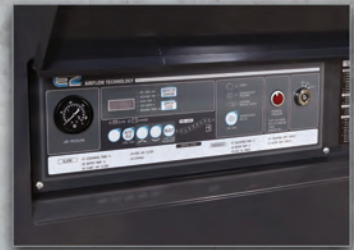
1 | Keyed Start and Digital Monitor with Auto Idle Mode