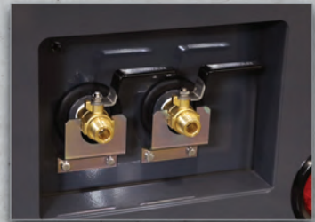
2 | Air Connections 3/4" Male Ball Valve x 2