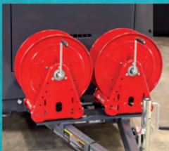
Double Hose Reel Kit