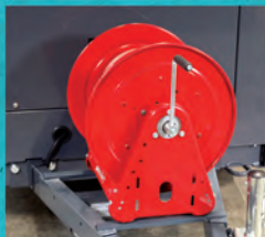
Single Hose Reel Kit