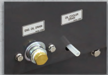
11 | Exterior Service Drains Quick drain valves for Engine Oil and Oil Cooler fluids