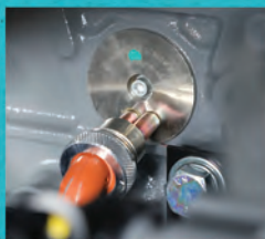
Engine Block Heater