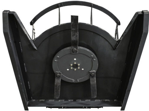
DETAIL UNDER DECK

4. CIRCULAR FLYWHEEL WITH 3 UPDRAFT BLADES BOUNCES OFF STUMPS