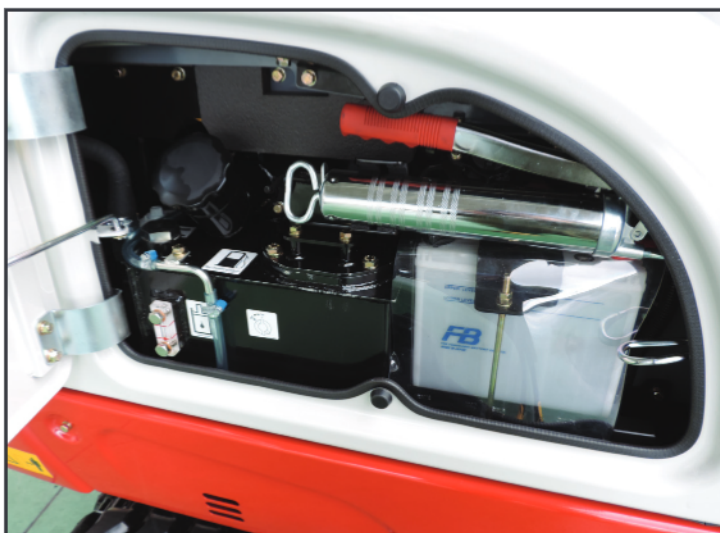
Convenient Service and Maintenance Access

*Functions may not be available in all countries, so please consult your Takeuchi dealer for details.