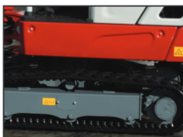
Triple Flange Track Rollers