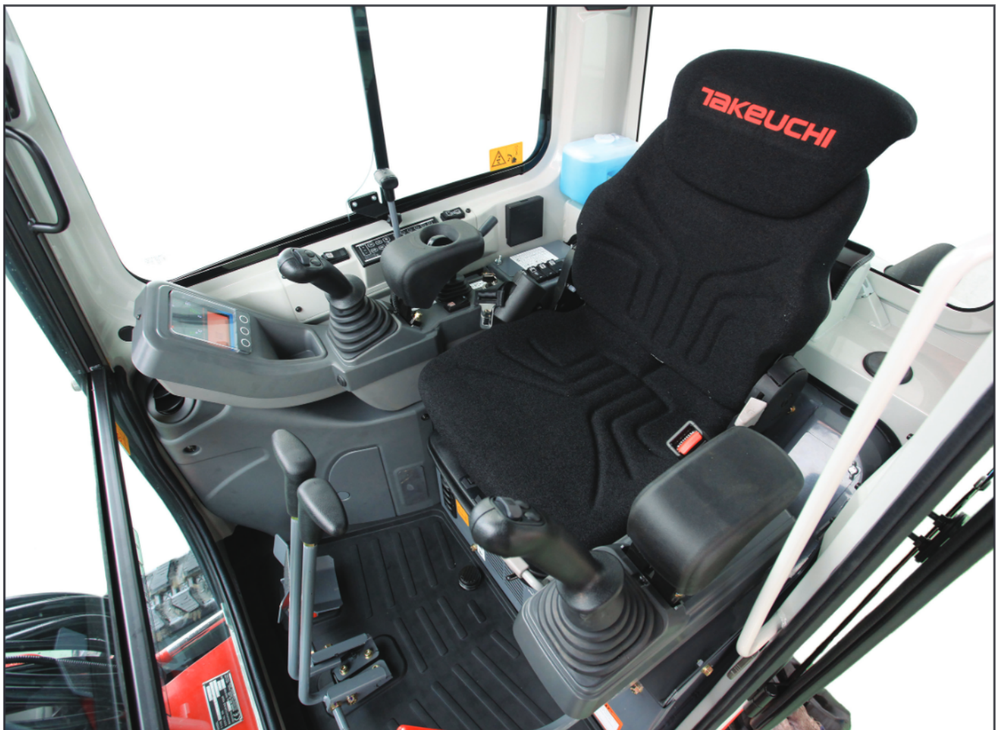
Spacious Operator's Station with Easy to Reach Controls and Switches.

The operator is protected by a ROPS / TOPS / OPG (TOP Guard, Level I) cab and canopy that keeps the operator safe and comfortable on any job site.