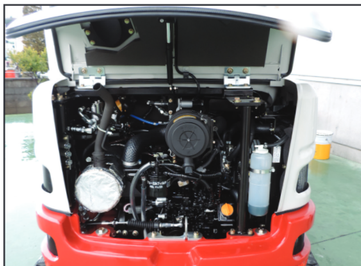
Large Lockable Service Covers Provide Ground Level Access