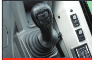
Pilot Operated Controls