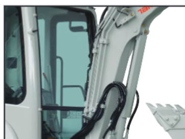
Main Boom Cylinder Guard