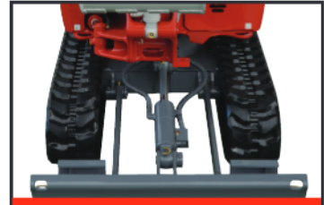
Retractable Track Frame

The TB225 features all steel construction, a spacious operator station, smooth hydraulic pilot joystick controls that deliver precise responsive controls. The TB225 provides the operator with the best in class engine output that allows more power and increases productivity.