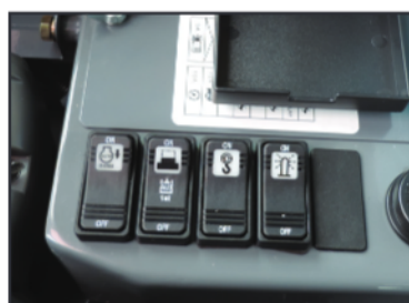
Multi-Function Switch Banks